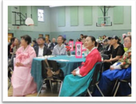
<Southeast Asian Elder Abuse Awareness Day Event / June 14, 2014>