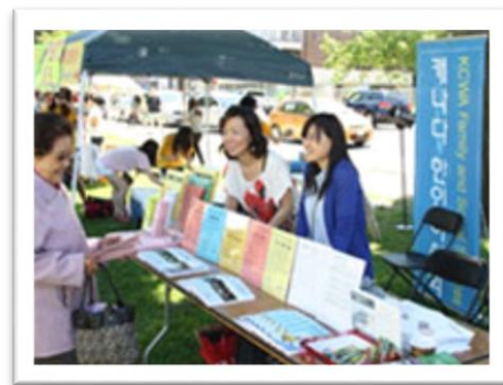
<Community Outreach Event: Totally 6 times (OKBA Trade Show, BF-Hub Open House Event, Dano Festival, Korean Thanksgiving Day Festival)>