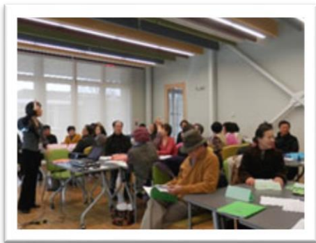
<Level 1 Training: 54 people registered / 42 participants had completed all sessions>