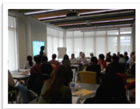
<Level 2 Training: 42 people from the level 1 registered / 31 participants had completed>