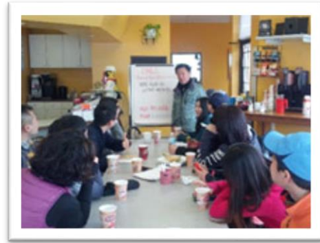
<Outreach Workshop: Totally 6 times / 77 attendances>