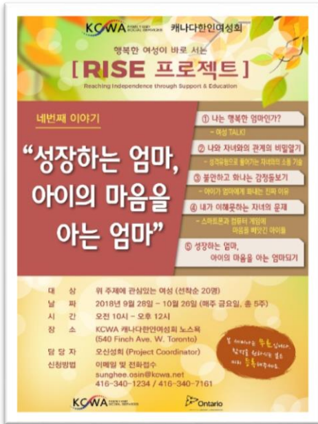
<Becoming a Happy Mother / 34 seminars, 363 participants >